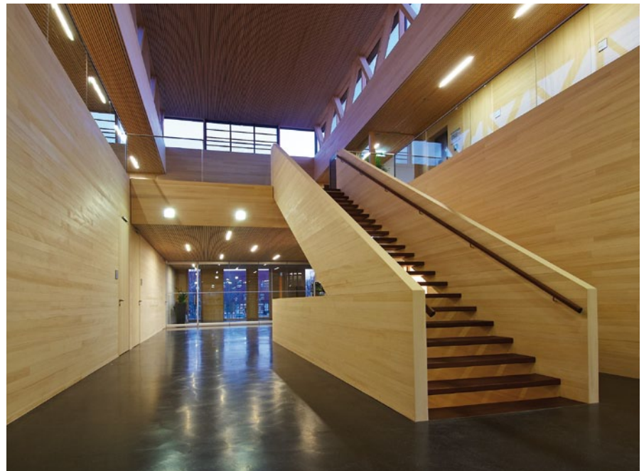
Daylight and artificial light accentuate the wooden decor.

square detection area of the detector enabled symmetrical positioning in the ceiling without having to cut corners in terms of detection quality