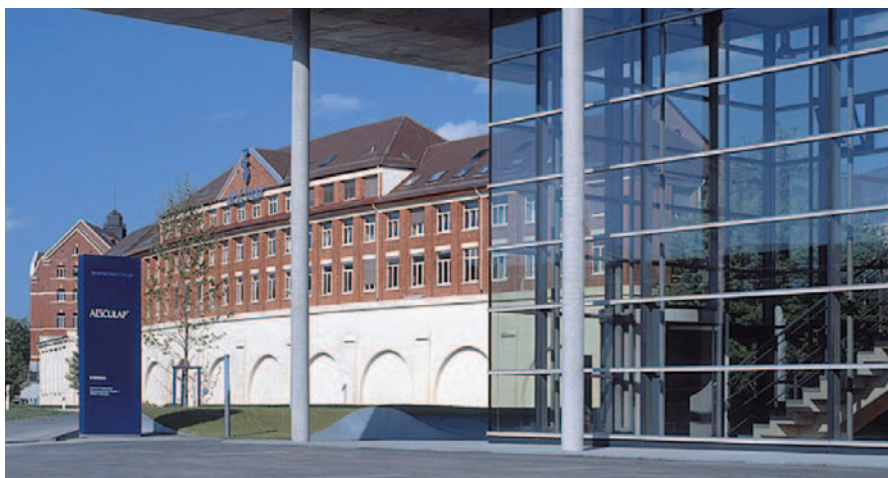
The 1898 Aesculap building by industrial architects Philipp Jakob Manz.