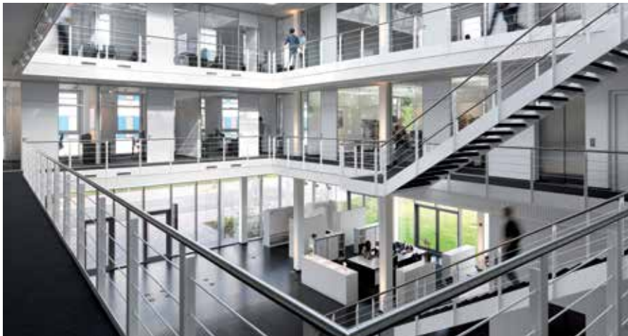
Light and transparent: the new construction from DIAL in Lüdenscheid, Germany

Due to the technical and design competence of DIAL, it was clear the planning for the building, building technology and lighting would be taken over under their own direction. Particular emphasis was placed on a close interaction of light planning, architecture and light design. DIAL was the leading hand for the construction until it was completed. About 2,000 m 2 useful area for office and conference rooms, laboratories as well as foyer, atrium, bistro and catering zone were created over three floors. The building has almost achieved the passive house standard so that it can do without conventional heaters as it only uses heat pumps. It goes without saying that DIAL wanted more than a faceless functional building. Moreover, one strived for a „good building“ as formulated by the deputy managing director, Dipl.-Ing. Dipl.-Wirt.-Ing. Andreas Bossow (graduate engineer/master of business and engineering). „A good building comprises a well considered interaction of architecture, technology, efficiency and individuality“, was his motto.