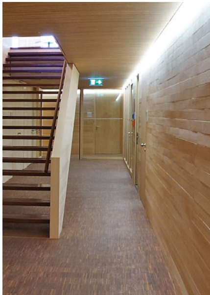
Harmonious integration of the PlanoCentro KNX presence detector

Colour matching to the silver fir wooden ceiling was achieved with the silver-coloured version (ESR-A) and with white frames (EWH-A) for plastered ceilings. And the subsequent planning was straightforward: The large