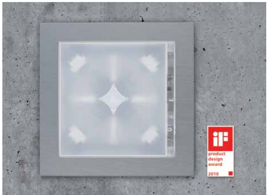
The PlanoCentro presence detector is one of the flattest cubic detectors on the market. It has been presented with the iF Award 2010 for its design.

The PlanoCentro detectors installed in the 30 offices must take over many tasks. Initially there is the constant light control according to the three different daylight flows low, medium and high. In doing so, the nominal value is moved permanently in order to simulate a wonderful sunny day. The detector controls a mixed light measurement to allow it to compensate the daylight in the room. This reduces the artificial light share that, on the other hand, has a positive effect on the lighting costs and the CO 2 effect. When the employee leaves the room, the lighting and ventilation are switched off. And this is why the detector must operate accurately. Here the PlanoCentro scores with a quadratic detection area. On the one hand it also detects the corners of the room and on the other hand, prevents faulty switching as it does „look into the corridor“ through the open door as with a detector with round detection area. The detection area depends on the installation height. With a 2.5 m detection area, it is 6 m x 6 m for persons sitting, or 8 m x 8 m for people walking. It is suitable for all conventional illuminants, such as fluorescent lamps, compact fluorescent lamps, halogen / incandescent lamps as well as