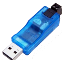
KNX USB Interface 332 Stick

Portable USB Interface Stick for KNX Bus